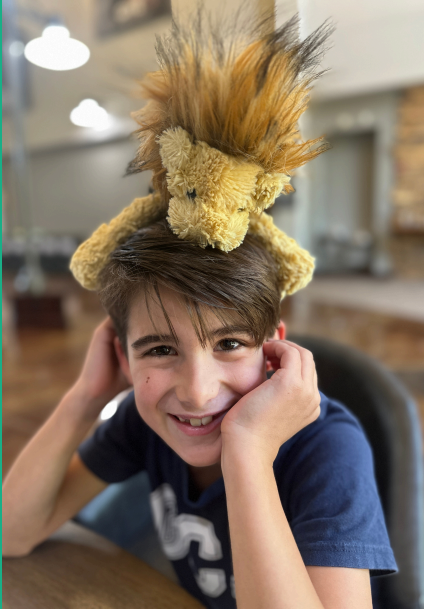
2nd grader (with Simba)